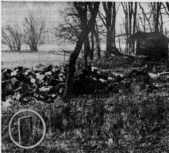
Historic gravestone of Battle of Newtown is located near a private dumping area in the Town of Ashland.